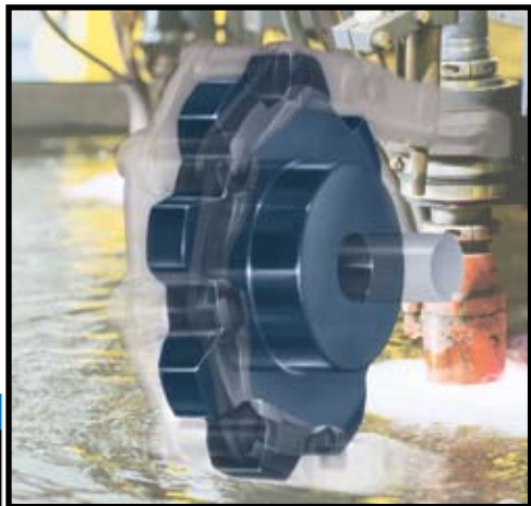
Martin offers a complete line of Engineering Class Sprockets.