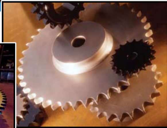
Martin manufactures solid and split sprockets in a variety of materials — both metallic and non-metallic.