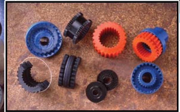
Martin manufactures all components, including a new, superior thermoplastic injection molded elastomer sleeve. That's what sets these flexible couplings apart from the rest.