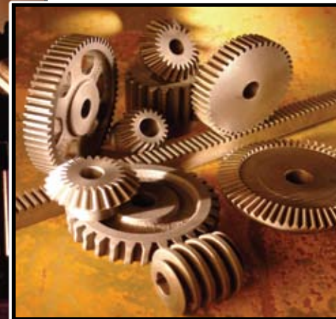
Martin manufactures spur gears and gear rack, bevel gears, miter gears, and worm gears. And, with a vast inventory of raw materials, modern machine tool capacity, and a pro-service attitude, Martin makes short work of quick delivery on all specialty gears.